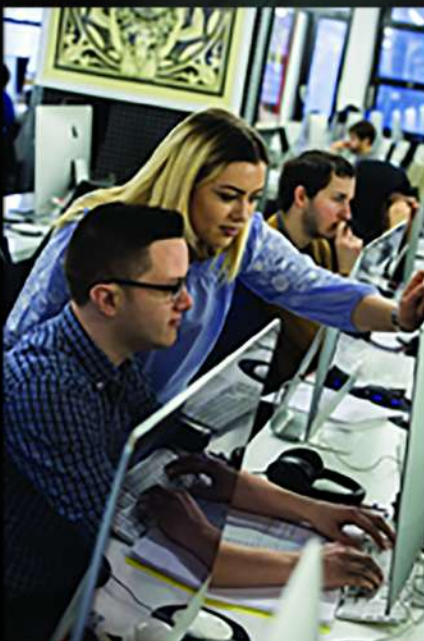
Ecole 42 Paris

42 uses a revolutionary approach called Peer-Learning where students are faced with software development challenges that need to be solved. With no teachers, no lectures, no MOOCs (Massive Open Online Courses), learners will seek information, learn how to filter and use it to co-create software. Collaboration is a key element of this process. 42 develops technical and soft skills anticipated by companies using a gamified approach that harbors an experimental try and fail model. 42 brings its students to a successful and sustainable career amidst the high demand of such professionals.